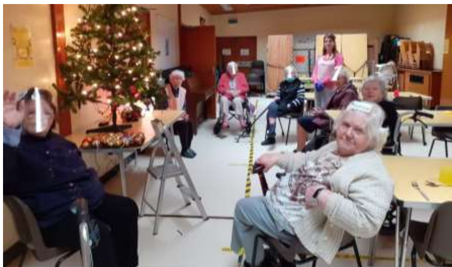
The Day Centres decorated the tree