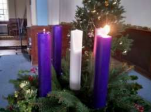
Back in Weoley Hill for the 2 nd Sunday of Advent