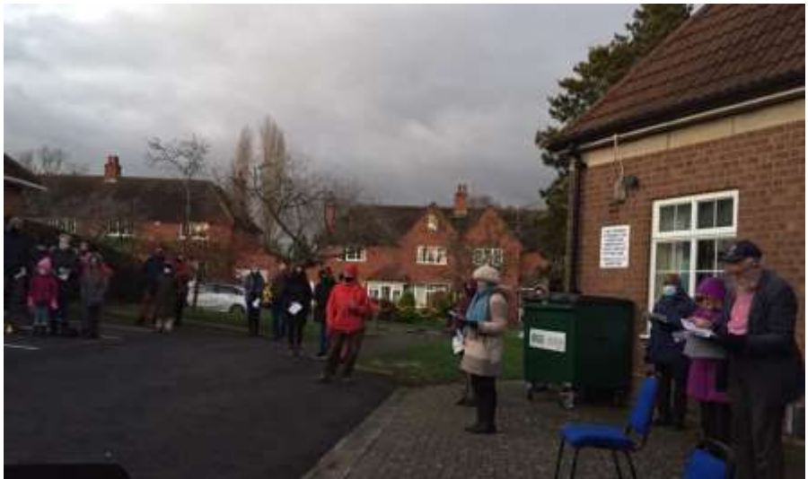
The carol service at Weoley Hill, postponed to a very cold and windy but dry Christmas Eve. At least 40 visitors, in well-spaced family groups, joined us.