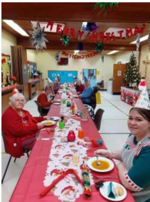
Day Centre Christmas Party