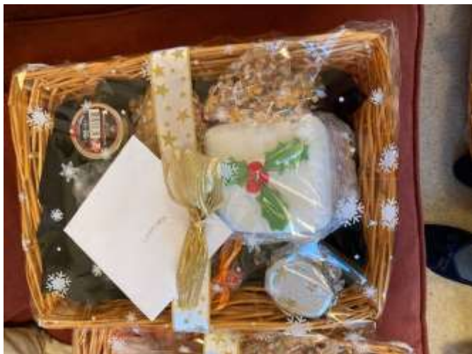
Weoley Hill Lunch Club hamper (