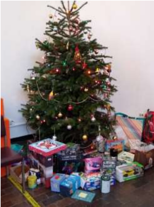
Weoley Castle gift service 13 December